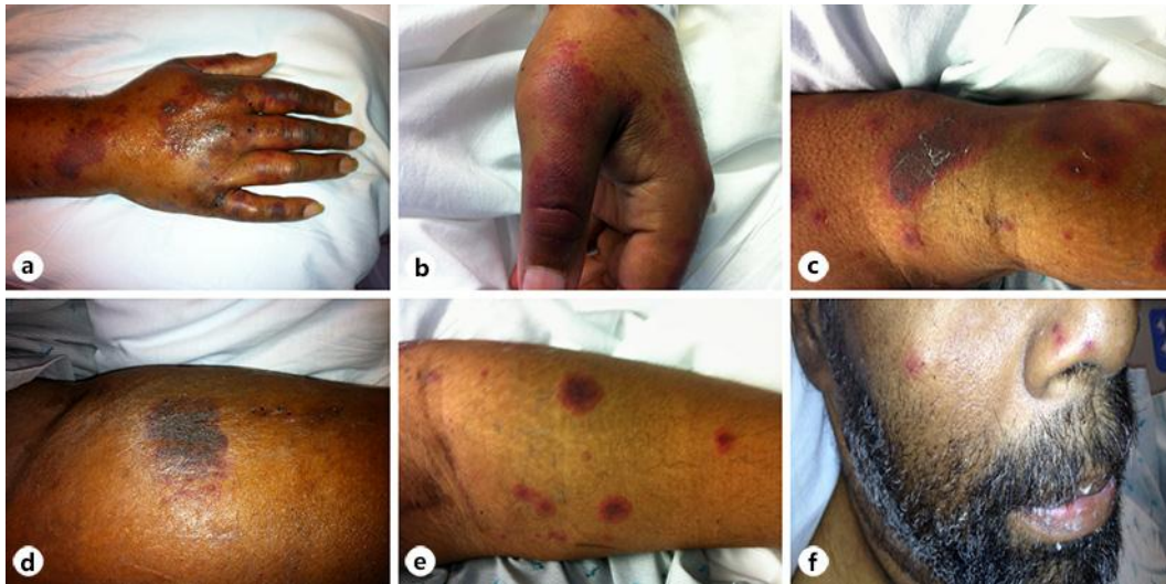
Fig. 1. LCV rash on various parts of the body. a, b Rash affecting hands and wrists bilaterally. c–e Rash involving both lower extremities: d shows rash affecting right buttock, c and e show rash affecting bilateral popliteal and calf regions. f Facial involvement.