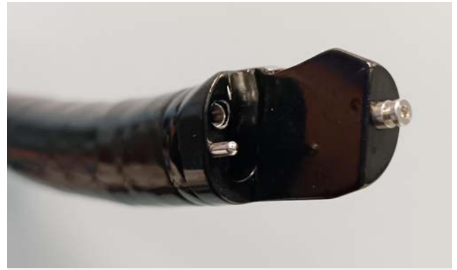
► Fig. 2 The image shows the distal portion of the endoscope, without wire and cap.