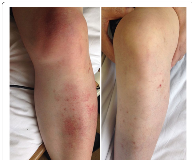
Fig. 1 Left, cellulitis in the left lower leg and knee. Local swelling with salmon-pink skin discoloration and local heat with spontaneous pain was evident. Right, left leg after 6 weeks of antibiotic therapy

A 54-year-old Asian man with IgA nephropathy underwent living-donor kidney transplantation 14 years previously. His medical condition had been almost stable for 14 years. He developed multifocal salmon-pink skin discoloration, and swelling and spontaneous pain in the left knee and leg. The symptoms had gradually expanded across the right forearm and outside of the right thigh. He was admitted to our hospital for the evaluation of fever (39 °C) and multifocal cellulitis (Fig. 1). Two months before admission, he had developed chronic diarrhea. His serum creatinine level was stabilized at 1.7 mg/dL with maintenance immunosuppressive therapy comprising tacrolimus (3 mg/day), mycophenolate mofetil (1500 mg/day), and prednisone (4 mg every other day). The tacrolimus trough concentration was 6.3 ng/mL. The patient had been a dog breeder for 12 years.