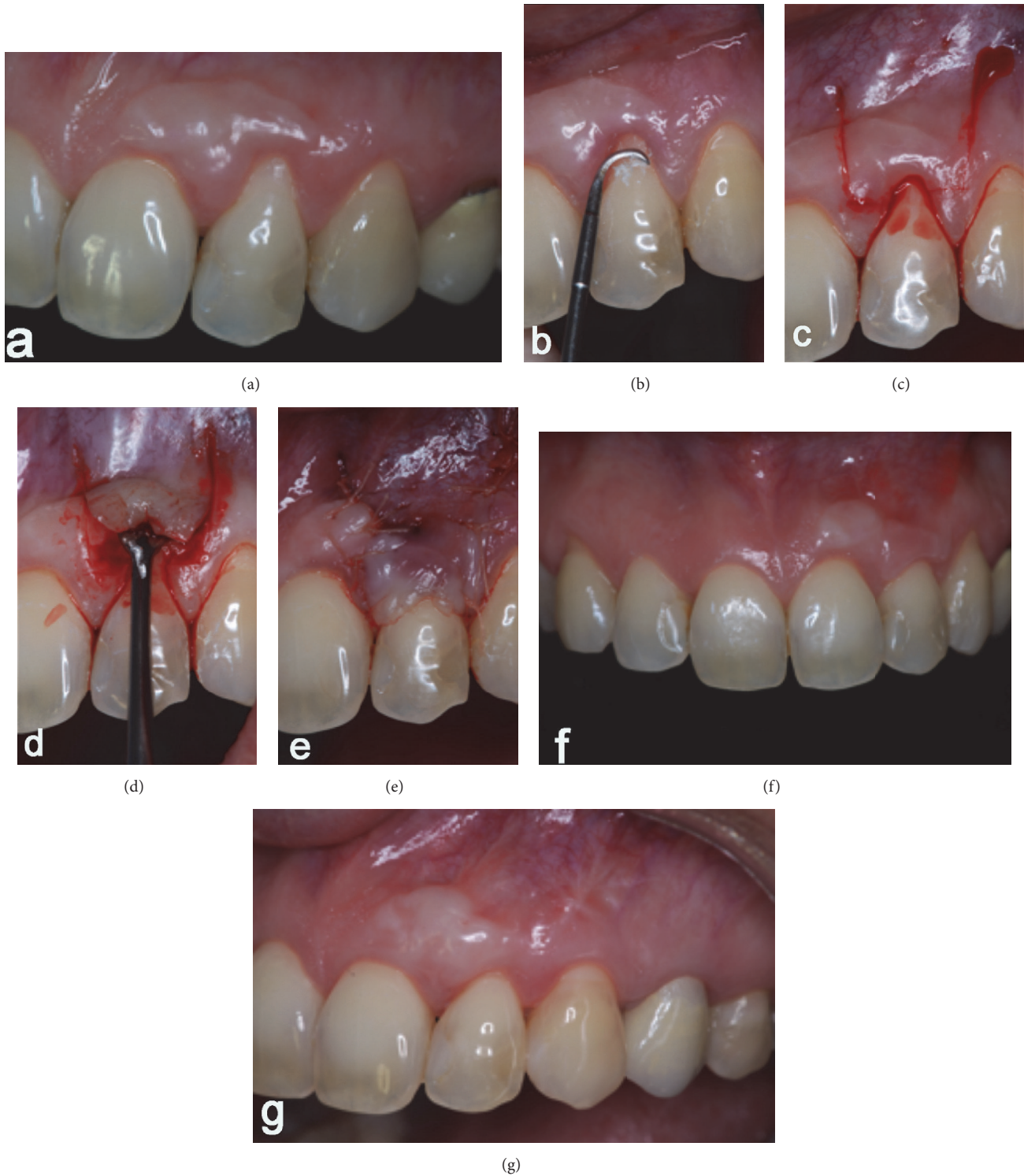
FIGURE 2: (a) After three months of the procedure; ((b), (c), (d), and (e)) a second surgical stage was performed in order to cover the exposed root of tooth 22; (f) root coverage of 100% after 6 months and (g) 5-year follow-up.

by the muscle fibers of the alveolar mucosa against the gum tissues. There is controversy regarding the amount of keratinized tissue to maintain gingival health. Mucogingival techniques are present in the literature to increase the zone of attached gingiva. Among the alternatives, the free