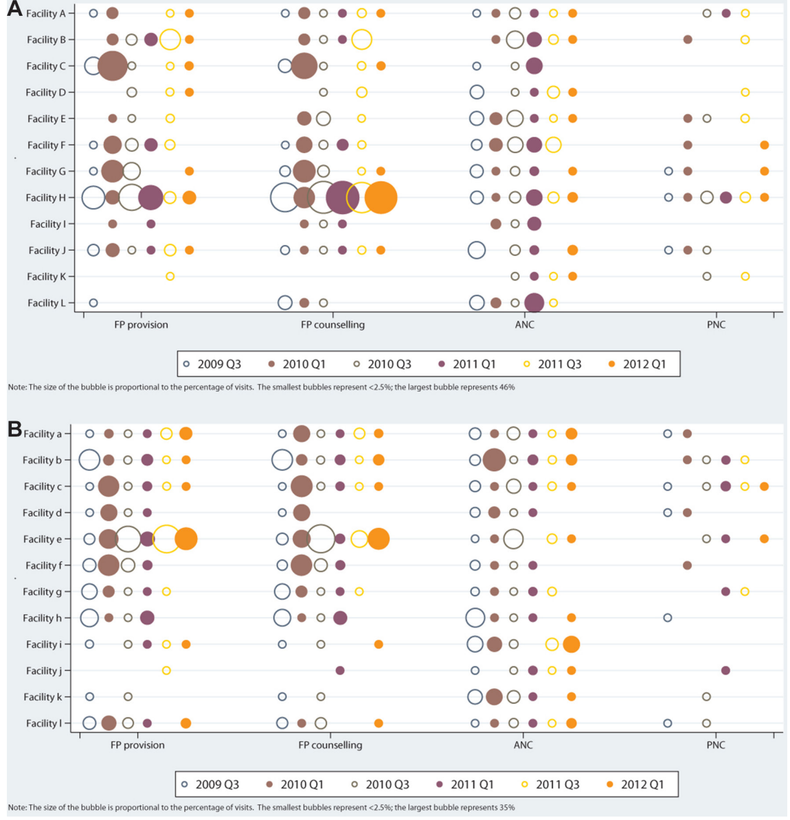
Figure 3 Proportion of RH visits in which an HIV/STI service was also received, by facility, RH service and round for HIV-PNC integration model (A) and HIV-FP model (B). ANC, antenatal care; FP, family planning; PNC, postnatal care; RH, reproductive health; STI, sexually transmitted infection.

continued funding and prioritisation as with PMTCT which has attracted substantial and sustained funding from large donors as part of the fight against HIV transmission to children. For routine testing in FP services, the supply of HIV testing kits, without which providers are unable to provide testing services and are less likely to offer HIV counselling, is also important. Related qualitative work also highlights the importance of providers. Provider commitment was challenged by staffing shortages, rotations and turnovers and increased workload. The importance of supervisory support, teamwork, staff being able to make flexible decisions and good communications between providers and across clinics within facilities—in the delivery of integrated care—has been observed in related publications.