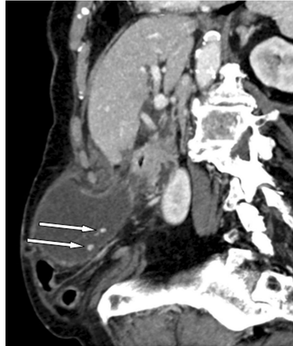
Figure 3 CT-scan pre-operative view. Note the absence of gallbladder fundus fixation, the presence of gallstones ( arrows ). On coronal planes we suspected a volvulus ( whirl-sign ).

Gallbladder torsion requires an emergency surgical procedure (cholecystectomy) since percutaneous cholecystostomy is not adapted in this particular situation (no