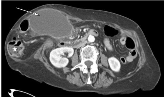
Figure 1 Pre-operative CT-scan. Incisional hernia containing the gallbladder ( arrow ) and digestive structure ( star ).