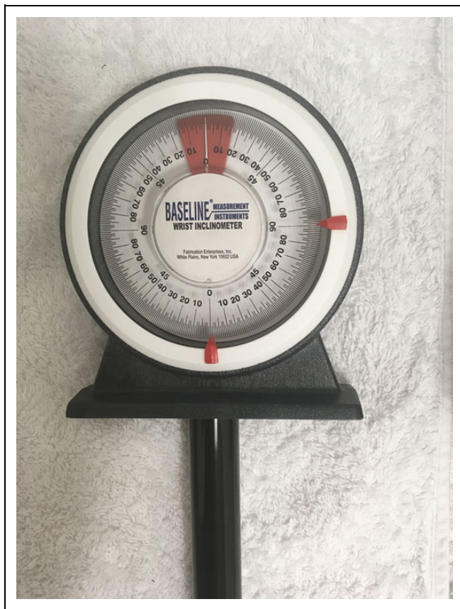
Figure 2. Wrist Inclinometer: Baseline Measurement Instrument, Fabrication Enterprises, Inc. White Plains, New York 10602, and USA.

notes at 2, 4 and 6 weeks, and 3 months post surgery when available. GS was collected at 6 weeks and 3 months post surgery when available. Number of treatments attended, cost of therapy materials used, time calculated in days until return to work and time (in days) until discharge from therapy was collected from the electronic clinical notes. The time to surgery was calculated in days from the date of injury to the date of surgery. Hand dominance, side of surgery and occupation was identified from clinical notes when available. Activity level was determined by the manual reviewer through assessment of the subjective notes. Occupation and hobbies were assessed and patients were grouped into high and low levels of functional upper limb demand. Patients who had an occupation that was heavy work (for example a manual laborer or builder), or who had a hobby that involved repeated upper limb motion (for example tennis) were categorized as high function. Patients who had a sedentary or desk based occupation and hobbies involving mostly lower limb activity (for example walking) were categorized as low function.