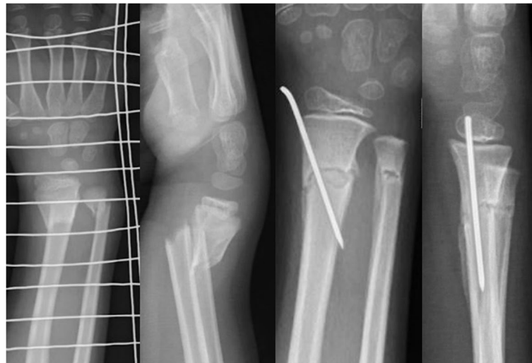
Fig. 1 Distal forearm fracture of a 8 years old boy. The fracture was stabilized with a K-wire

the Local Ethical Committees. (Péterfy Hospital, Ethics Committee) (License number:11/2021).