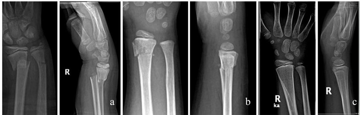
Fig. 4 Distal forearm fracture of a 7-years old boy treated with Activa Pin™ a: shortened and displaced unstable distal metaphyseal fracture b: X-rays made in the postoperative first day c: X-rays made 24 months after surgery