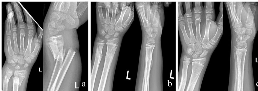
Fig. 5 Distal forearm fracture of a 11-years old boy treated with Activa Pin™ a: shortened and displaced unstable distal meta-diaphyseal fracture b: X-rays made after 12 weeks of surgery c: X-rays made 24 months after surgery