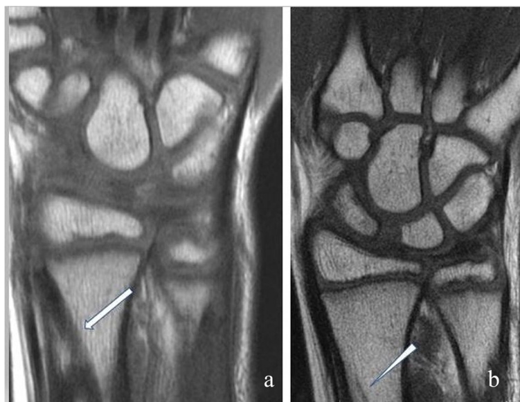
Fig. 6 MRI image after PLGA implant placement a: half a year after the surgery, the implant is clearly visible (arrow) b: two years later only minimal traces of the implant are visible (arrowhead). There is no sign of growth disturbance