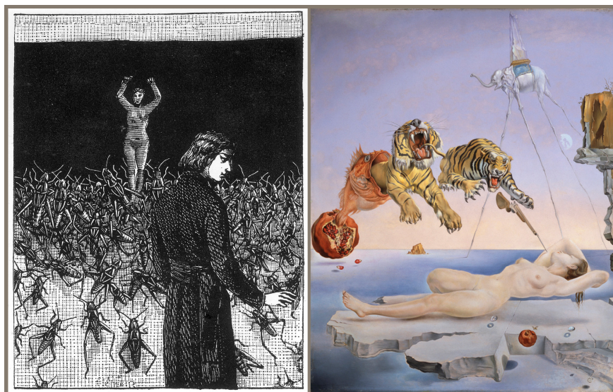
Figure 1. Insects in surrealist dreamscapes. Several dreams depicted in Max Ernst’s book of collages Rêve d’une petite fille qui voulut entrer au Carmel ( Dream of a little girl who wanted to join the Carmelite order , 1930) portray insects, including ... Hoppla! Hoppla! ... (left; reproduced with permission from V.G. Bild-Kunst, Bonn, Germany, 2011); A bee buzzes by a dreamer’s ear in Dream Caused by the Flight of a Bee Around a Pomegranate a Second Before Awakening (right; Salvador Dalí, 1944, reproduced with permission from Fundació Gala-Salvador Dalí/V.G. Bild-Kunst, Bonn, Germany, 2011).

Psychoanalysis and dream studies, especially when crawling with insects, are simply too riveting to remain in the office or laboratory. Psychoanalytical studies inspired insect dream paintings by Salvador Dalí and collages by Max Ernst (Figure 1). Filmmakers often conjure up horrific insect dream sequences ripe for psychoanalysis, whether it be of someone turning into a giant cockroach ( Nightmare on Elm Street 4 , 1988), or giving birth to an over-sized maggot ( The Fly , 1986). In music, insects can also play fearful dream roles ( I Dream of Bees , by The Bloody Hollies, 2011), but they often appear in more tranquil dream visions ( Dream of the Gryllidae , album by Yumi Hara and Tony Lowe, 2010; Dragonfly Dream by Cylab, 2010; and any number of butterfly or moth dream songs). See Coelho’s writings for a glimpse of how common it is for musicians to dream of insects [53,54].