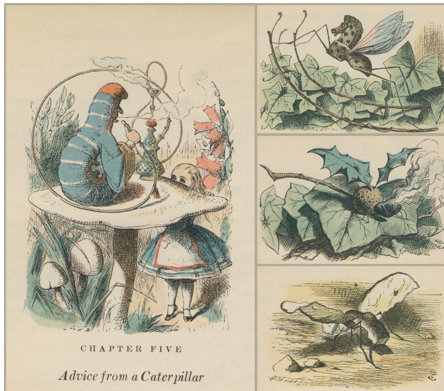
Figure 2. John Tenniel illustrated the Caterpillar (left) for Lewis Carroll’s Alice’s Adventures in Wonderland , and the Rocking-horse-fly, the Snap-dragon-fly, and the Bread-and-butter-fly (right) for Through the Looking-Glass and What Alice Found There .

Ivan Turgenev, a Russian poet, also recorded his dreams, as in “ The Insect ,” written in the late nineteenth century.