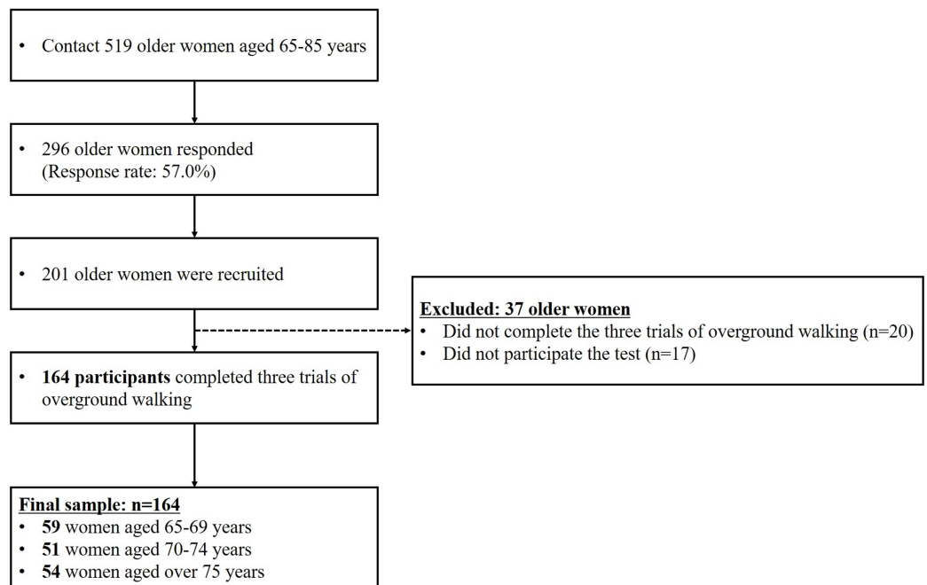
Figure 1 Flow diagram explaining criteria for participant selection.