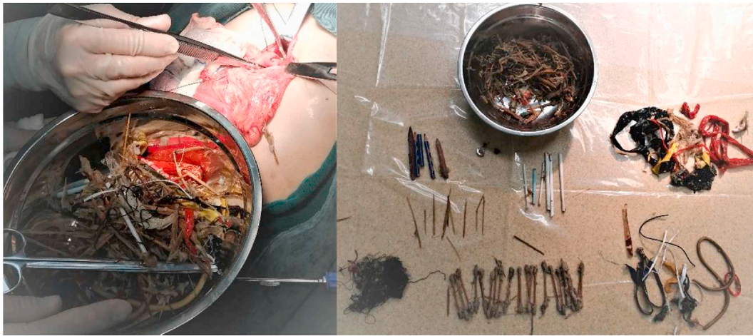
Fig. 3. Various foreign bodies removed from the stomach.

threads, at the same time. These soft FBs potentially isolated and wrapped other sharp FBs and reduced the damage to the digestive tract. Second, the patient actively swallowed FBs, and swallowing an FB by mistake caused more obvious nerve reflexes and muscle contractions. Third, children exhibit a strong ability to repair gastrointestinal mucosa.