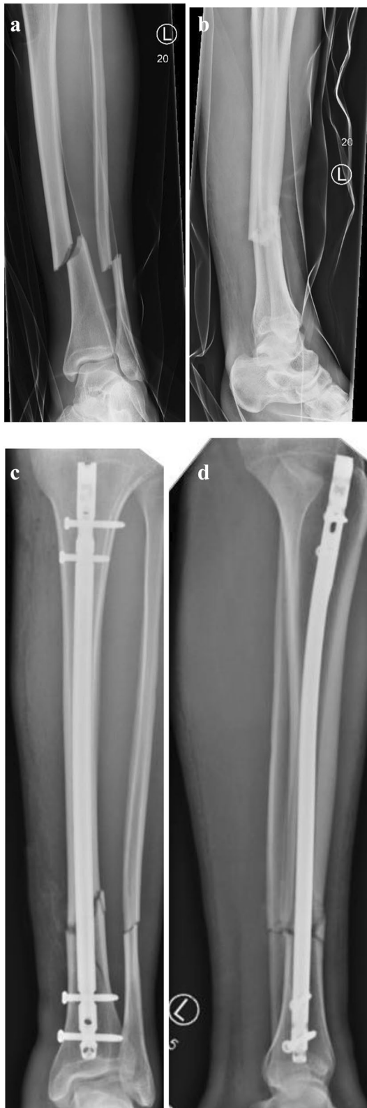
Fig. 3 Thirty-two-year-old male patient with a closed fracture of the lower leg (AO 42B2) X-ray in ap (a) and lateral view (b). AP X-ray (c) and lateral (d) view after closed reduction and internal fixation via intramedullary nail (Tibia EXPERT™ nail, Synthes, West Chester, PA, USA)

comprising Gram-negative Aeromonas species or Gram-positive Enterococcus species [17, 18]. In our data collection, specimens were taken from five patients and pathogens were found in three. All three patients had mixed infection with samples positive for Enterococcus species.