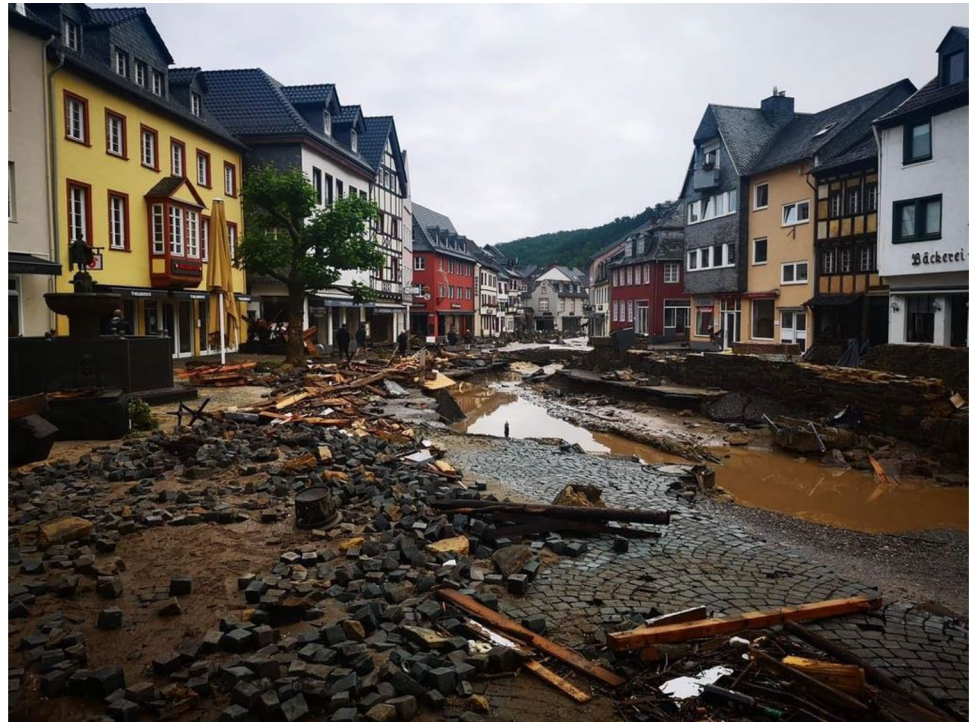
Fig. 4 Representation of the destruction using the example of Bad Münstereifel on 16 July 2021

emergency plans to determine whether they can be used in the event of natural catastrophes.