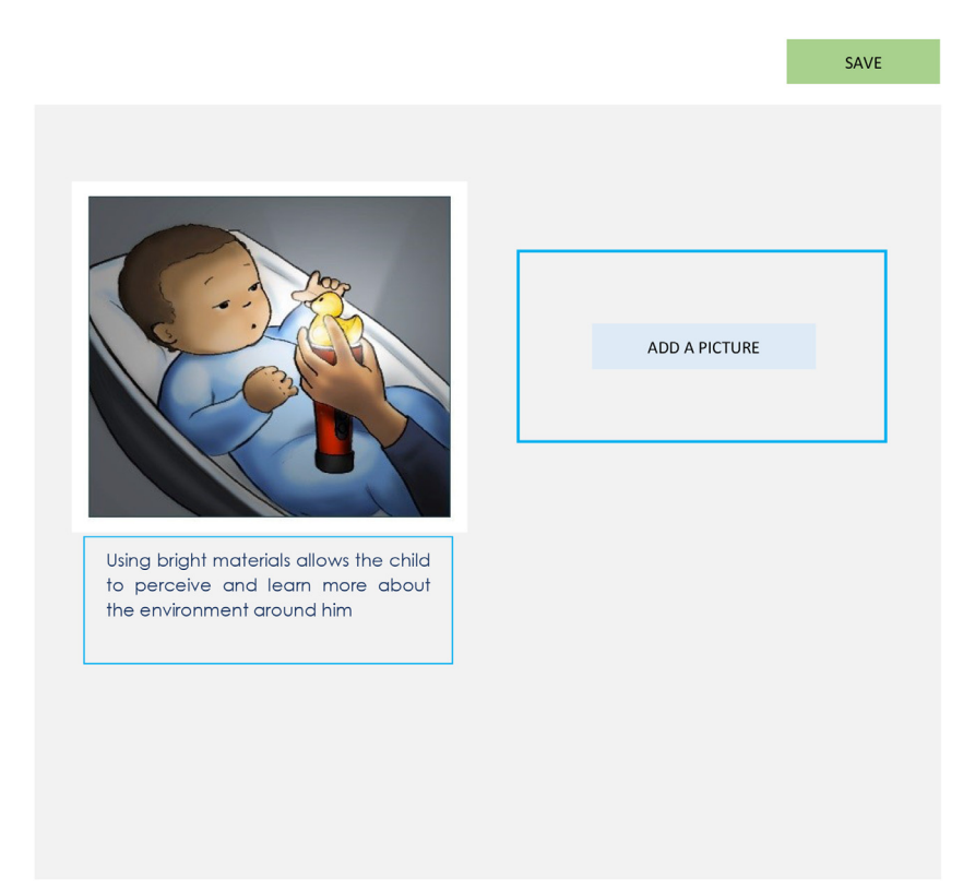
Fig. 7. Insert other pictures.