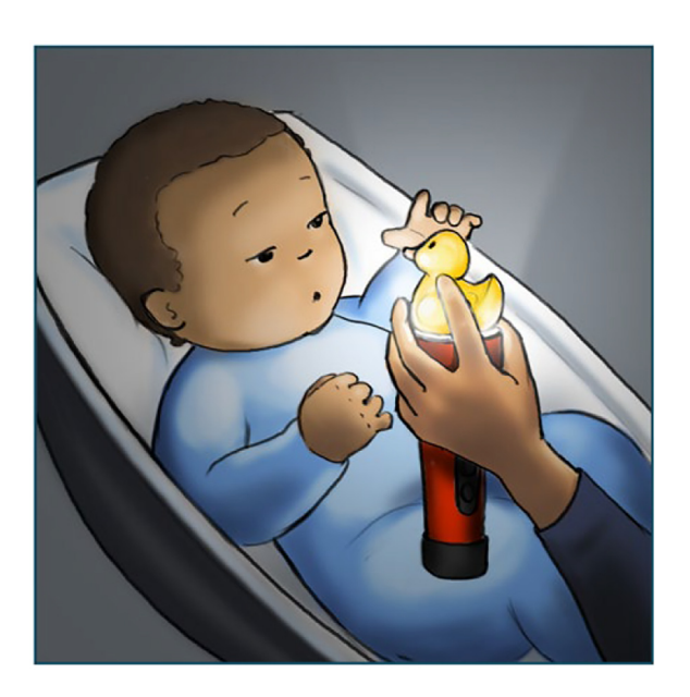
Fig. 2. An example of an HF picture.