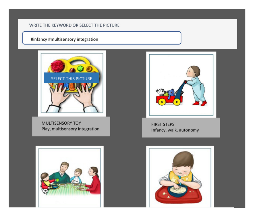
Fig. 5. Select the image from a pictures' database.