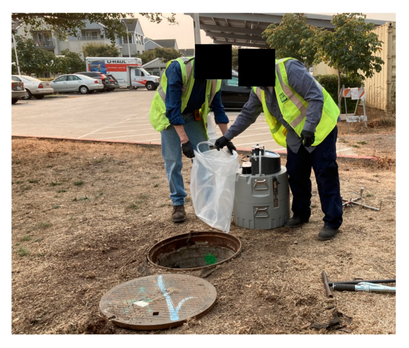
Figure 2. Staff prepare to deploy an automated composite sampler at UC Berkeley.

Notes: * Planning to transition to composite samplers in Spring 2021. ** Combine multiple grab samples (3/day) taken at each sample site. ^{\Delta} Different sites sampled at different frequencies, number in table denotes most common frequency across sites. ^{\Delta\Delta} Number of sampling sites varies.