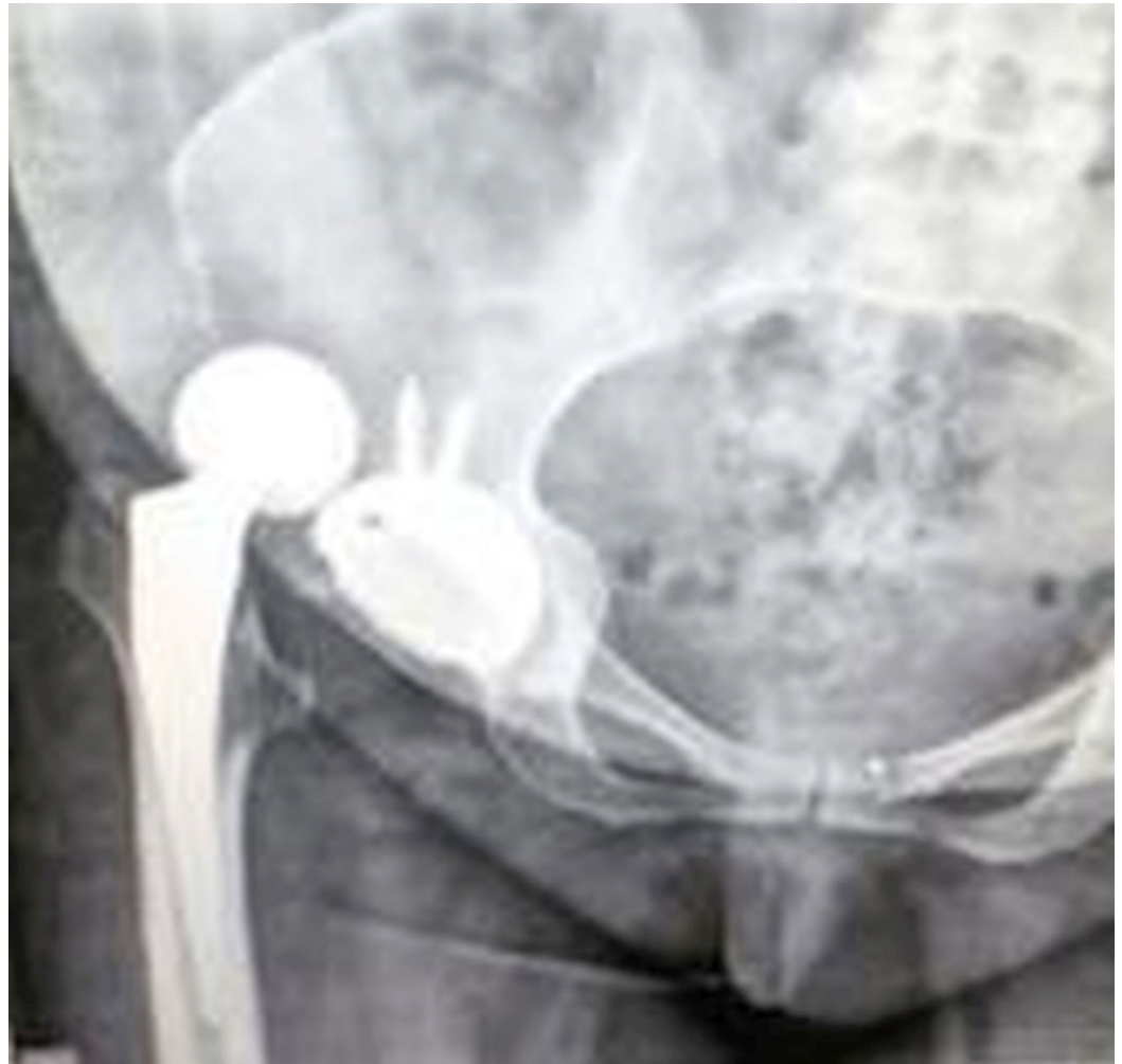
FIGURE 4: One month postoperative X-Ray of right hip. Anteroposterior view (AP) showing dislocated total hip replacement.

Radiographs showed posterior dislocation of the total hip prosthesis (Figure 4).