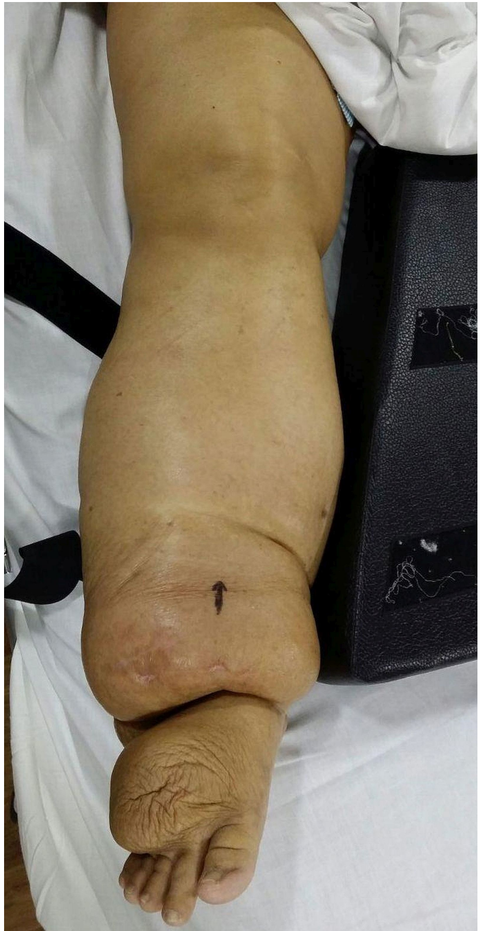
FIGURE 1: Clinical picture showing chronic lymphedema of the