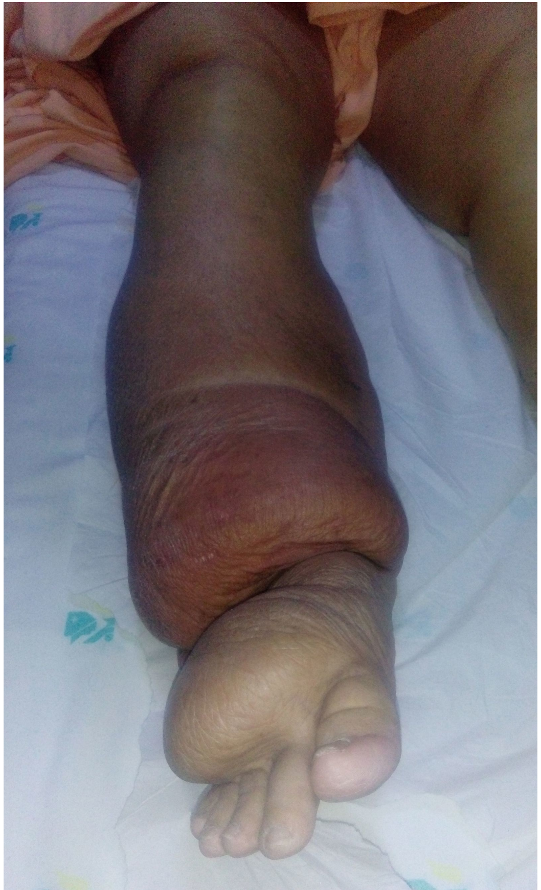
FIGURE 3: Note the shiny and tense skin associated with massive swelling of the whole right leg.