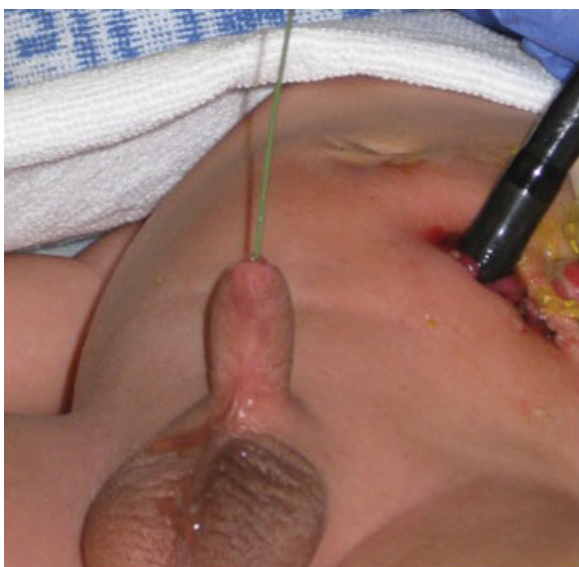
Fig. 2 Through the endoscope of 9 mm, a guidewire of 2.5 mm has been passed through the rectourethral fistula.

The postoperative course was uneventful. An X-ray of the urinary bladder and urethra, voiding cystourethrogram, performed 6 weeks later showed a normal urinary tract without any fistula to the bowel.