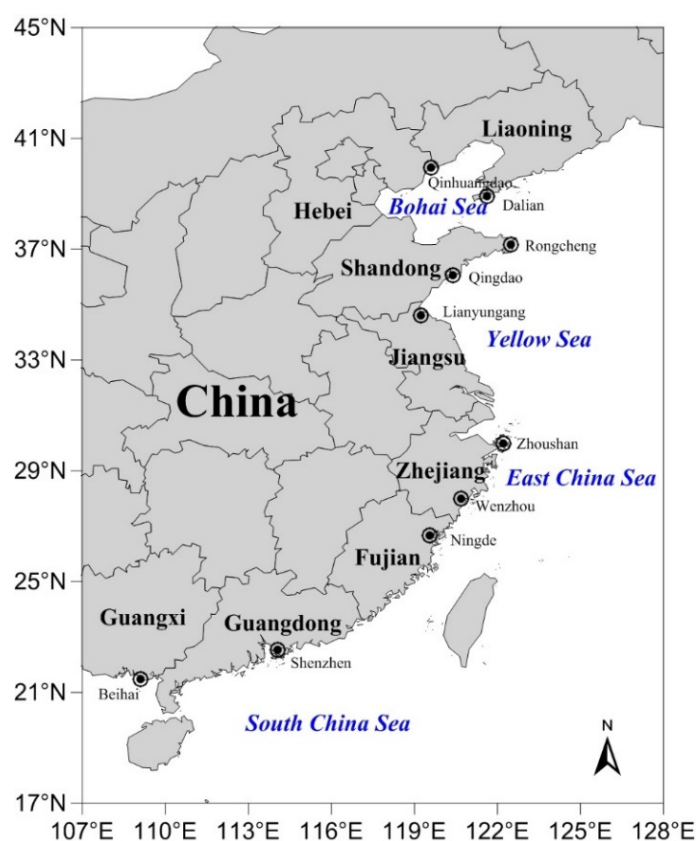
Figure 1. Sampling locations for marine mollusk animals collected in March 2016 and analyzed for \beta - N -methylamino-L-alanine (BMAA), 2,4-diaminobutyric acid (DAB) and N -2(aminoethyl)glycine (AEG) in this study (samples were collected from aquaculture zones in Zhoushan and Shenzhen cities, the other samples were purchased from local seafood markets in other eight cities).

In addition to cyanobacteria as an originating source of BMAA, a marine dinoflagellate ( Heterocapsa triquetra ) and diatoms ( Achnanthes sp., Navicula pelliculosa , Skeletonema marinoi , Thalassiosira sp., Proboscia inermis ) have also been implicated [16,17]. A picture is developing of widespread occurrence of BMAA in aquatic organisms (Table S1) [18–38]. Of particular interest is the presence of BMAA in marine animals collected from the coastal area of Florida, USA, and the southern coast of Stockholm, Sweden [22,23]. Furthermore, BMAA was also detected in samples of mussels and oysters cultivated in seawater using LC-MS/MS analysis of underivatized extracts [35–37]. However, the controversy regarding data on BMAA in aquatic ecosystems has also been reviewed by Faassen [39], who demonstrated that it is still need to develop and validate the precise analytical methods for BMAA in the future. Based on these new findings, contamination with BMAA and its isomers 2,4-diaminobutyric acid (DAB) and N -2(aminoethyl)glycine (AEG) was investigated in diverse mollusks collected from ten cities along the Chinese coast in this study (Figure 1). It is the objective of the present study to assess the risk of the neurotoxin BMAA in marine mollusks in order to protect seafood safety and consumer health.