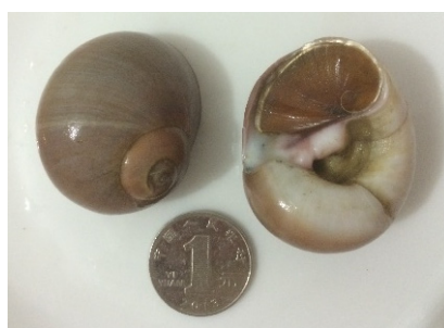
Figure 2. Photograph of wild benthic gastropod Neverita didyma as a typical vector of neurotoxin BMAA in Chinese marine ecosystem.

BMAA was detected in a total of five samples from three marine species collected from Chinese coastal waters. DAB was detected in 78% of the samples (53/68) representing 23 species in this research (Table 1). The highest concentrations of BMAA were detected in the same species of benthic gastropod Neverita didyma collected from Dalian, Rongcheng, and Lianyungang cities in March 2016, respectively (Figure 2). BMAA was also detected in two additional samples of N. didyma collected from Laizhou and Qingdao cities. Neither BMAA nor DAB was detected in the protein of any mollusk species. The identity of BMAA was confirmed in the samples of N. didyma using an extract spiked with mixed standards which was then compared with the original extract of N. didyma (Figure 3). The intensity of the selective reaction monitoring (SRM) transitions (measured as a percent of the total peak areas of four qualitative transitions) was used to identify BMAA, DAB, and AEG as compared to standard solutions, the original extract, and spiked extracts of N. didyma (Table 2). HILIC-MS/MS chromatograms for original extract and spiked extract of N. didyma clearly demonstrated that the BMAA and DAB were present (Figure 3). Retention times of BMAA, DAB, and AEG peaks slightly shifted in different extracts of mollusk samples due to the effect of matrix on the HILIC column separation. Concentrations of 16 protein amino acids in three samples of gastropod N. didyma were also determined (Table S2).