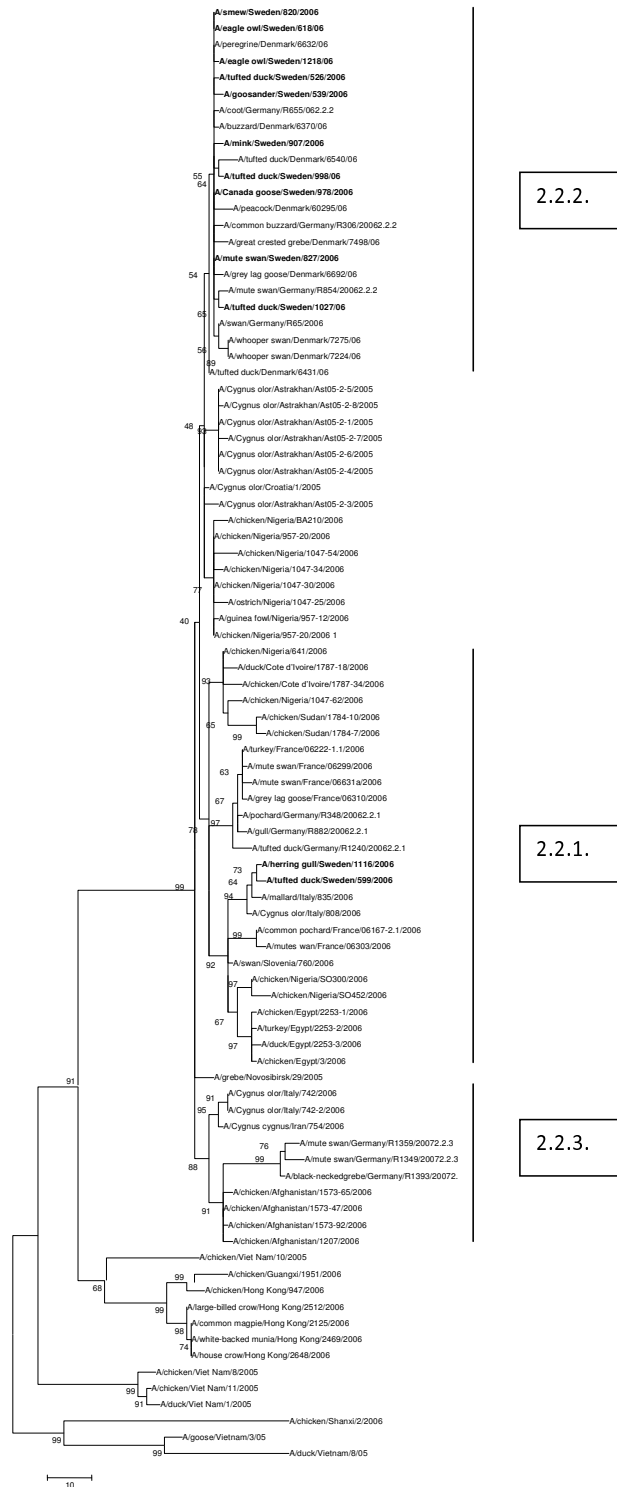
Figure 1 Evolutionary relationships of HA genes of Swedish HP H5N1 AIVs compared to genetically closely related H5N1 viruses isolated in Europe. The phylogenetic trees were generated by maximum parsimony analysis (neighbor-joining revealed similar tree topologies). Bootstrap values of 1000 resamplings in per cent are indicated at key nodes. The Swedish viruses are highlighted by bold letters.