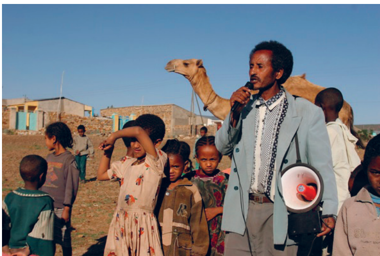
Photo: Man speaking about polio vaccination

The in-depth understanding and experiences of the beneficiaries of any public health intervention is key to the utilisation and improvement of the said service and herein lies the strength of qualitative research.