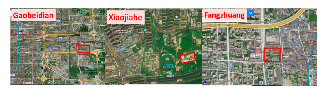
Figure 1. Aerial images of Gaobeidian, Xiajiahe and Fangzhuang WWTPs in Beijing (red line indicates boundary of WWTPs).

The second type includes the Qinghe, Beixiaohe, Jiuxianqiao, Xiao Hongmen and Beiyuan WWTPs, which were constructed near green parks. For example, Qinghe plant was close to the west of Beijing Olympic Park. In most cases, the occupied lands by parks were much larger than those by WWTPs. The negative effects of WWTPs may be covered by the positive effects of green parks when they are built together. Thus, in this study, only the three solo built WWTPs—Gaobeidian, Xiajiahe and Fangzhuang—were selected to evaluate their impacts on surrounding housing prices.