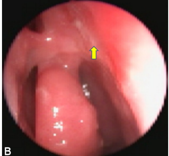
Figure 2: A) Intranasal silicone tube and fibrotic tissue (arrow). B) Intranasal synechia and narrow ostium (arrow).

All three cases had undergone dacryocystorhinostomy combined with bicanalicular intubation to improve the postoperative success rate. The location of the stent was appropriate and the stent was well tolerated by the patients without any allergic complication. Although the nasal ostium was open during the early postoperative period, osteal stricture was seen after seconder fibrotic healing of nasal mucosa (Figure 2B). Displacement of the tube narrowing the ostium and prolonged intubation may have been the cause of secondary stent tension and cheese wiring in all three cases.