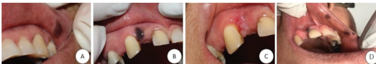
Fig. 1: Clinical aspect of OMA. A) Brownish macula with precise limits localized in the upper lip region on the right side. B) Presence of blackish macula in the maxillary anterior region. C) Brownish macula of smaller size, localized in the upper lip region on the left side. D) Final clinical aspect of OMA after 28 months of follow-up of patient. Three brownish macula localized in the upper lip on the left side, and presence of other blackish macula in the gingiva anterior region.

OMA is a rapid growing lesion occurring mainly in black individuals, and in the majority of cases, in women (2.1:1), with a mean age of 28 years (2,5,6). Thus, differing from the case here related, in which the patient was white. Brooks et al. (7) emphasized that only 10% of cases of OMA were observed in white individuals. In decreasing order, this lesion affects the jugal, labial, palatal and alveolar mucosas. In the present case, gingiva and upper lip were affected, bilaterally. According to Tapia et al. (6), gingiva is outstanding as an atypical site for OMA. According to a previous study by Brooks et al. (7), only 18.9% of the patients with OMA present multiple lesions. Thus, they show evidence of peculiar clinical characteristics of the case here related. In order to review of the literature, it was made a table with a summary of prior reported cases of OMA (Table 1), published until 10th January 2019. With respect to cuta-