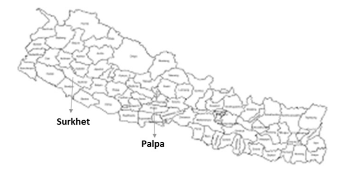
FIGURE 1. Location of study area.

Sample size for efficacy of the intervention (sandfly density reduction). The sample size was calculated based on the assumptions of a 55% reduction achieved by the intervention.