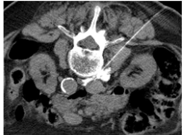
Figure 2. A CT scan in the case of right-sided lumbar sympathicolysis: intercavovertebral positioning of the puncture needle and distribution of the sympatholytic agent.

Near-infrared spectroscopy. Near-infrared spectroscopy (NIRS) is a non-invasive optical method for measuring tissue oxygenation. Detection is conducted in the near-infrared range at a wavelength of 700–1300 nm. The change in the absorption spectrum of hemoglobin (Hb) in relation to the level of oxygenation is used to measure regional oxygen saturation. If there is an increase in focal