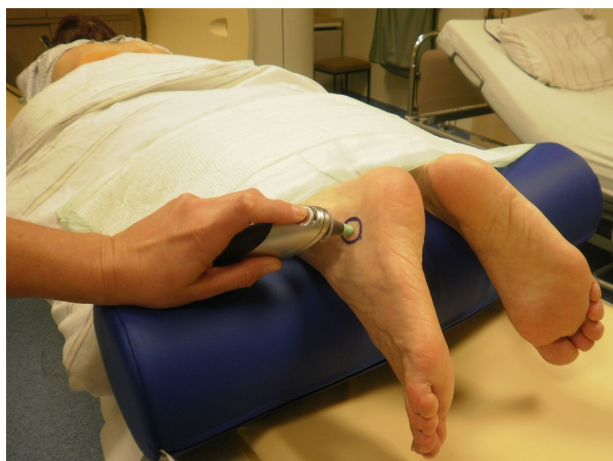
Figure 5. Measurement of skin temperature with an infrared thermometer.

Skin temperature measurement. For skin temperature measurement on the feet, an infrared ear thermometer was used (Braun ThermoScan 6021). After positioning of the patient on the CT table and an acclimatization phase of 10–15 minutes, pre-interventional temperature measurement was performed on the lateral dorsum of the foot. The measuring points were marked with a skin marker pen (Fig. 5). The post-interventional temperature measurement was done