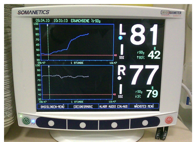
Figure 3. Monitor unit of the INVOS 5100C.