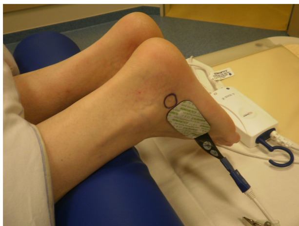
Figure 4. Placement of the sensor pads of the INVOS 5100C on the feet.

express the ratio of oxyhemoglobin to deoxyhemoglobin as regional oxygen saturation (rSO 2 ). 9,10