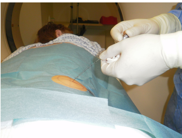
Figure 1. Right dorsolateral puncture with a 22G Chiba biopsy needle in the right-sided CT-guided lumbar sympathicolysis.

During the CT-guided lumbar sympathicolysis, somatic regional oxygen saturation in the distal lower limbs was measured using the commercially available NIRS system INVOS 5100C (Covidien) (Fig. 3). The INVOS 5100C utilizes an emitter (LED) with wavelengths of 730 and 810 nm as well as two detectors at a distance of 30 and 40 mm from the emitter. The absorption measurement of the chromophores (oxyhemoglobin and deoxyhemoglobin) with two detectors and a proprietary subtraction algorithm makes it possible to