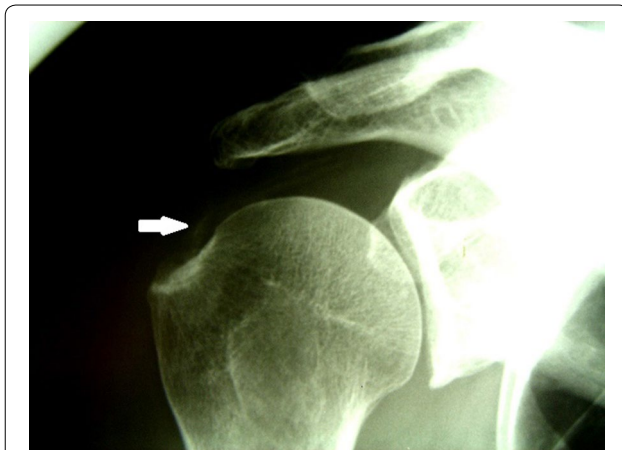
Fig. 1 AP X-ray of the shoulder showing a type III calcifying lesion. White arrow pointing at the soft contour of the linear calcifications infiltrating the tendon

Karzel 1993). Injections with corticosteroids combined with local anesthetic agents are often effective adjuvant. Shockwave therapy can be used as part of the conservative therapy or as part of a neo-adjuvant treatment prior to surgical excision leading to improved outcomes compared to surgery alone (Jiménez-Martín et al. 2012). When conservative therapy fails in terms of symptom control and the deposits don't show any sign of spontaneous resolution, open or arthroscopic surgery is warranted. Most authors agree that complete excision of the calcium deposits with or without acromioplasty and or bursectomy should be the goal of arthroscopic treatment (Porcellini et al. 2004).