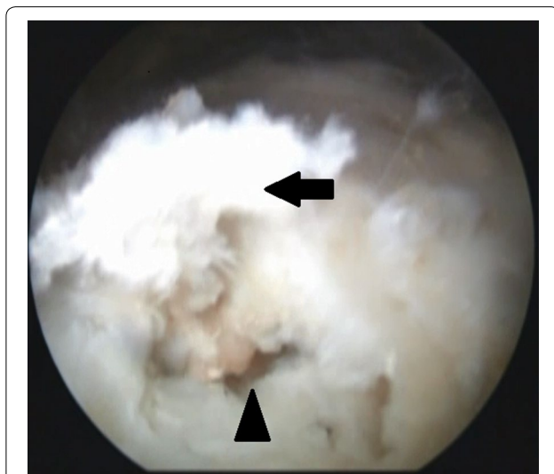
Fig. 3 Lateral portal arthroscopic view showing a large defect in the supraspinatus tendon as a result of calcification scrapping. Black arrow pointing at part of the tendon that became detached due to scrapping and curettage of the lesion. Black arrow head pointing at the defect

Unlike type I or II calcification (wherein the calcium deposit is localized and superficial), type III calcification is more infiltrated and deeper in the tendon. The cause of pain in patients with type III CT is not clear. Uthoff et al. (2006) proposed that it originates from increased intra-tendinous pressure in the vicinity of the calcium deposits. The cause of pain is a consequence of the inflammatory cascade that started with the beginning