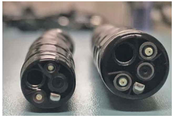
► Fig. 1 Features of the small-caliber colonoscope (9.2-mm diameter, PCF-PQ260L, left) and the standard colonoscope (12.2-mm diameter, CF-Q260AI, right).

Women who were scheduled to undergo total colonoscopy were considered eligible for inclusion in this study. The exclusion criteria were defined as follows: (1) age < 20 years; (2) his-