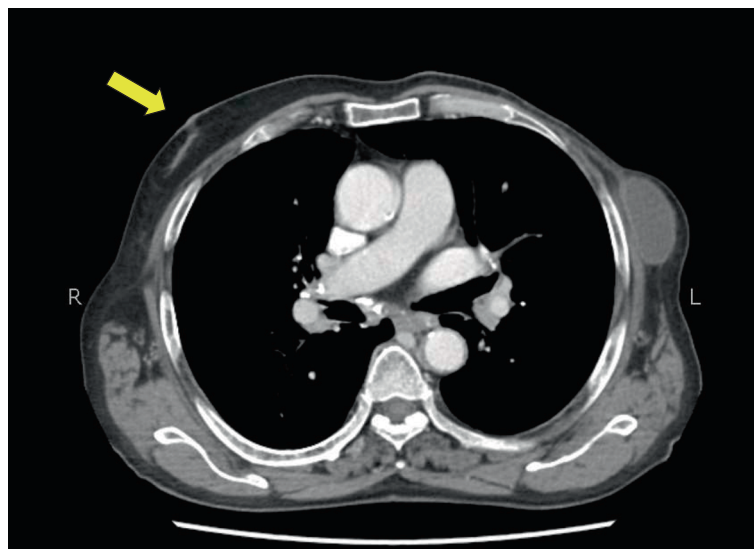
Figure 1 Computed tomographic image highlighting right sided gynaecomastia (yellow arrow) and left sided postoperative changes with seroma formation.

Tumor cells were negative for E-cadherin immunostain (Figure 3) and thus based on morphology and immunoprofile a diagnosis of invasive lobular carcinoma, pleomorphic variant was rendered. The neoplastic cells were strongly positive for estrogen receptor expression but only displayed weak positivity for expression of the progesterone receptor. Her2-Neu staining by immunohistochemistry revealed a score of +1 and the Ki-67 proliferative index was 20-25%.