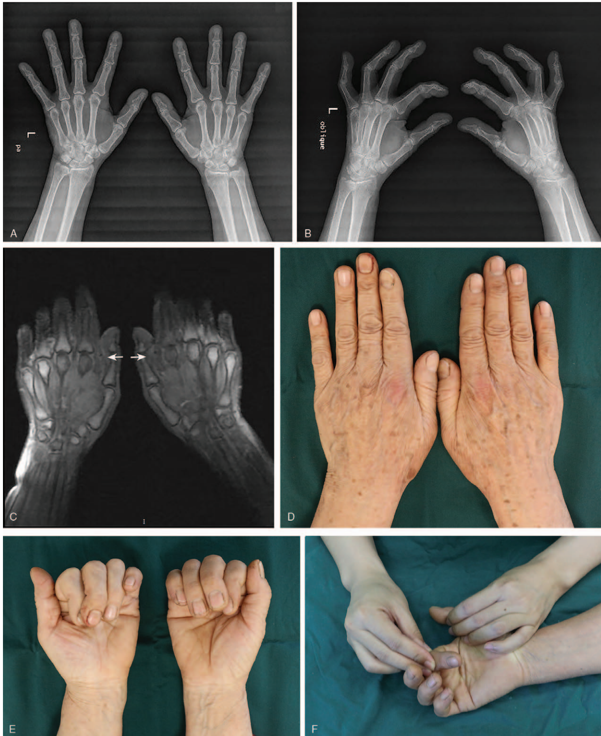
Figure 1. Preoperative imaging. (A and B) MCP joint subluxation of bilateral index fingers on an X-ray. (C) An MRI image confirmed rupture of both RCLs (white arrow). (D) Redness and swelling of the skin at the site of injury. (E) Ulnar deviation and pronation of index finger during active gripping. (F) Passive physical examination. MCP=metacarpophalangeal joint, MRI=magnetic resonance imaging, RCL=radial collateral ligament.

aggravated while gripping, pulling, buttoning, and twisting, and Bohler's sign was positive on both sides. An X-ray confirmed MCP joint subluxation of both index fingers (Fig. 1A and B). Ultrasonic and MRI examination showed disruption of bilateral RCLs, bone erosion and synovitis of index fingers (Fig. 1C).