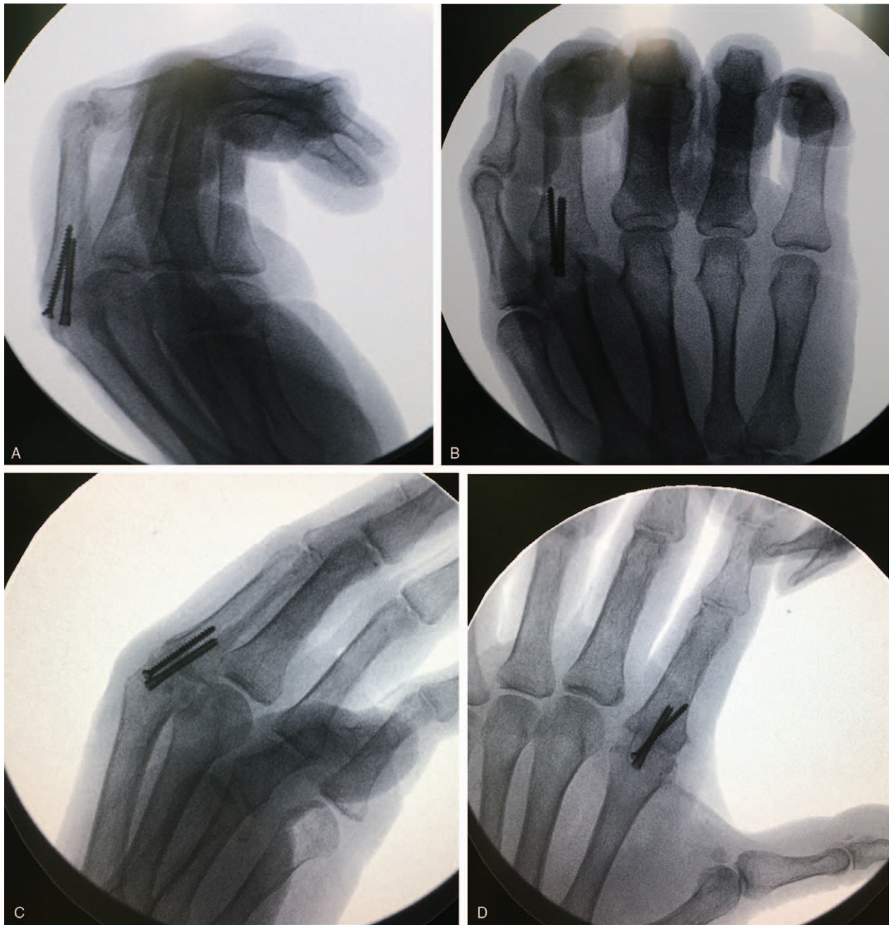
Figure 3. MCP joints were immobilized with screws in 30° of flexion. (A and B) Lateral and anteroposterior X-rays of the right hand. (C and D) Lateral and anteroposterior X-rays of the left hand.

incidence of musculoskeletal disorders. [19] The stable pinch mechanism depends on the integrity of the RCL of the index MCP joint combined with the ulnar collateral ligament of the thumb MCP joint. [10] Gupta et al [20] reported reduced pinch strength among shoe factory workers, and they explained that a sore thumb prevented them from exerting maximum pressure. However, the cause of pain was not described. In published articles, the cause of RCL injury of the index finger is mostly traumatic, however, the other causes of RCL injury are not yet known. In our case, the patient presented with long-term symptoms without any history of an obvious accident and she