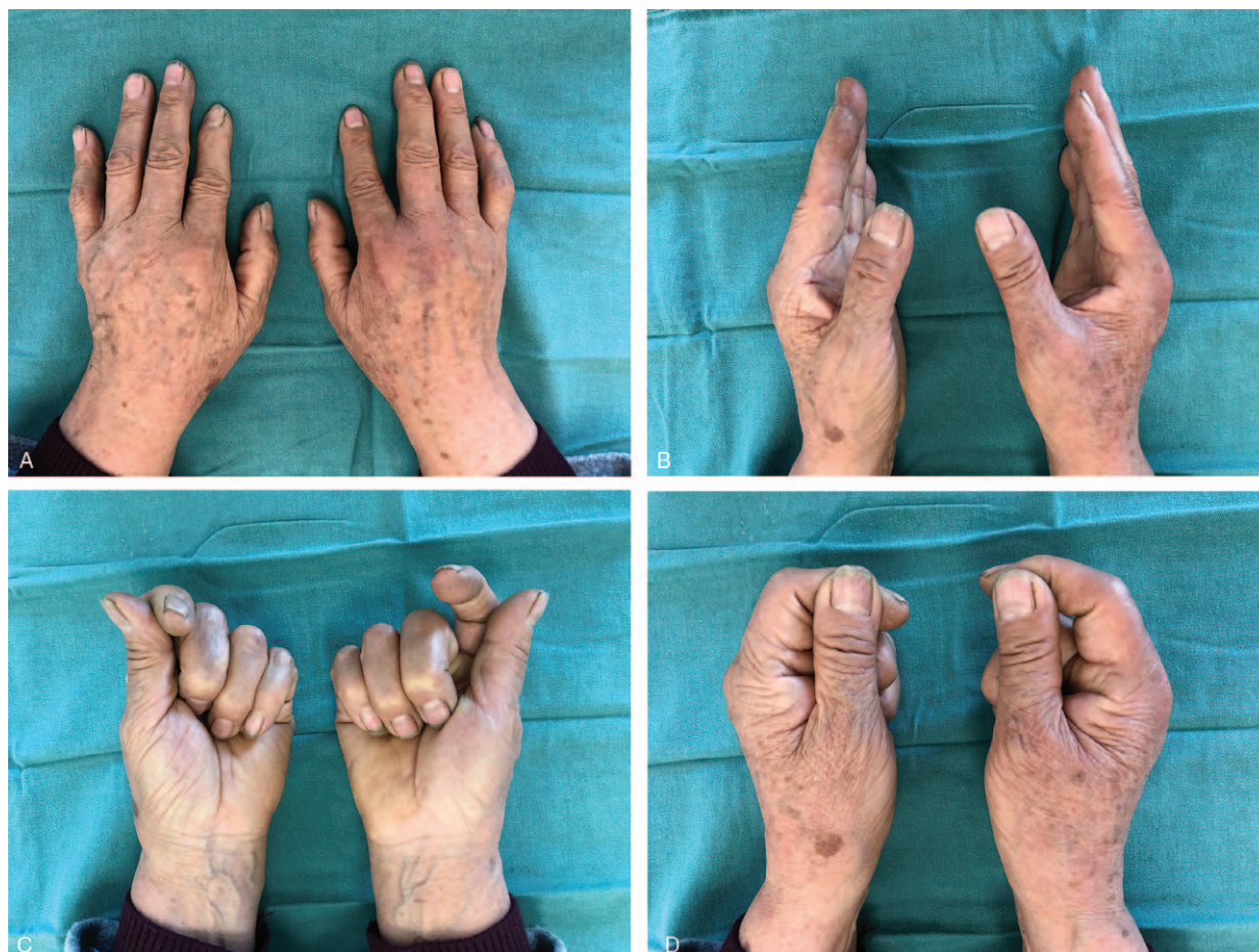
Figure 4. Final Follow-up Images. (A–C) The patient’s MCP joints were immobilized in flexion. (D) The patient was able to achieve the key pinch position.