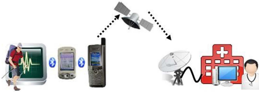
Figure 1. Illustration of the real-time ECG satellite transmission system. Left to Right: One lead ECG is transmitted via Bluetooth to a PDA, which forwards the signal to a satellite phone again through Bluetooth. The satellite phone acts as a modem and sends the data through a satellite to the servers in Taiwan, which then dispatches the ECG data to the smart phone and the PC of the team doctor. doi:10.1371/journal.pone.0066579.g001

the Institute Review Board of Taipei Veterans General Hospital. A consent form was signed by each climber prior to the study.