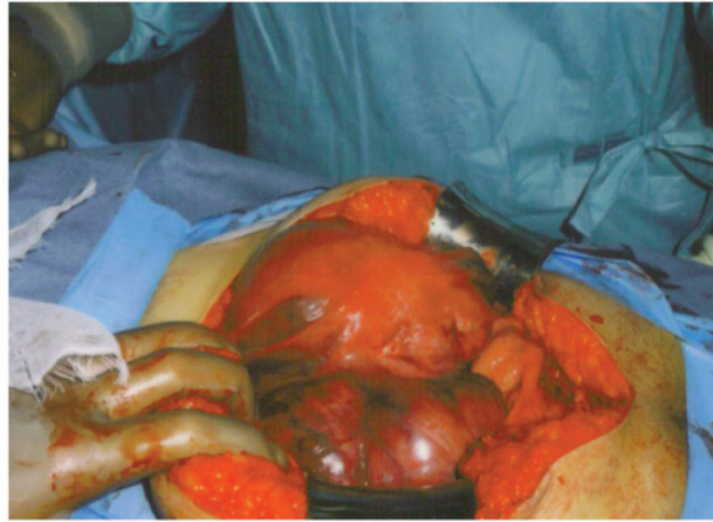
Figure 1. Exploratory laparotomy revealed a large tumor extending outside of the pelvis and invading the colon.