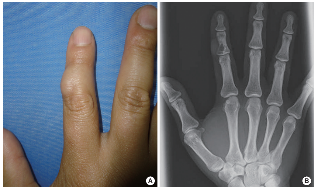
Fig. 1. Preoperative findings. (A) Clinical photograph of the right index finger with a visible mass protruding from the dorsoradial side of the middle phalanx. (B) Preoperative anteroposterior X-ray film of the right index finger reveals radiolucent tumor in the metaphyseal-diaphyseal area of the middle phalanx.

CMF was first described by Jaffe and Lichtenstein in 1948, and it is a rare, slowly growing benign bone tumor of cartilaginous origin. It accounts for less than 1% of all the primary bone tumors and less than 2% of benign bone tumors. Approximately 80% of the total cases occur in individuals aged 36 years or younger.