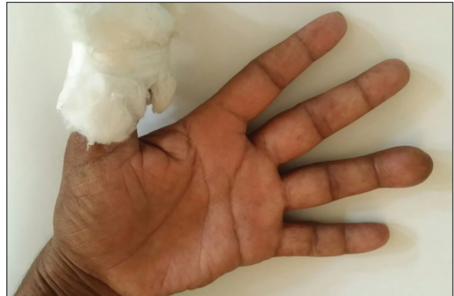
Figure 1: Globular swelling of the fingertips with adrenaline pack at biopsy site

This is an open access article distributed under the terms of the Creative Commons Attribution-NonCommercial-ShareAlike 3.0 License, which allows others to remix, tweak, and build upon the work non-commercially, as long as the author is credited and the new creations are licensed under the identical terms.