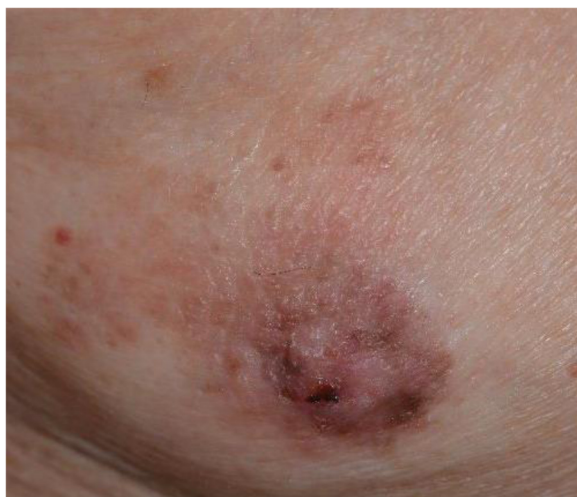
Fig. 1 Right breast at initial presentation. Erosion and redness of the nipple were noted, and lateral accretion of Paget's disease was suspected. A 1.0-cm movable lump was identified in the breast

Between 1980 and 2015, eight case reports were identified from the MEDLINE (Table 1). The age of patients