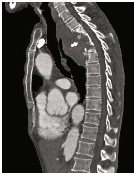
FIGURE 1: Sagittal section of a chest CT angiography showing the lysis of the vertebral bodies of D2, D3, D4, and D5 without displacement of the posterior wall.