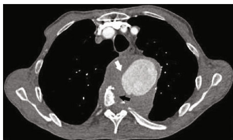
FIGURE 2: Axial section of a chest CT angiography showing aneurysmal formation (white arrow) implanted between the butt and the descending aorta, partially thrombosed coming into direct contact with the anterior surface of the vertebral bodies of the dorsal spine, responsible for bone lysis (black arrow) with a positive draped aortic sign.

the signs of aneurysmal rupture (intra- or retroperitoneal hematoma) or predictive signs of rupture, such as rupture of the continuity of parietal calcifications and the sign of the crescent or the sign of the draped aorta [6]; the latter is of great diagnostic value, and it is considered positive when the posterior wall of an aortic aneurysm is draped or molded on the anterior surface of the vertebra, with loss of the fat planes located between the aneurysm and the vertebra. Its presence indicates a weakening of the aortic wall and an imminent risk of rupture [5, 6].