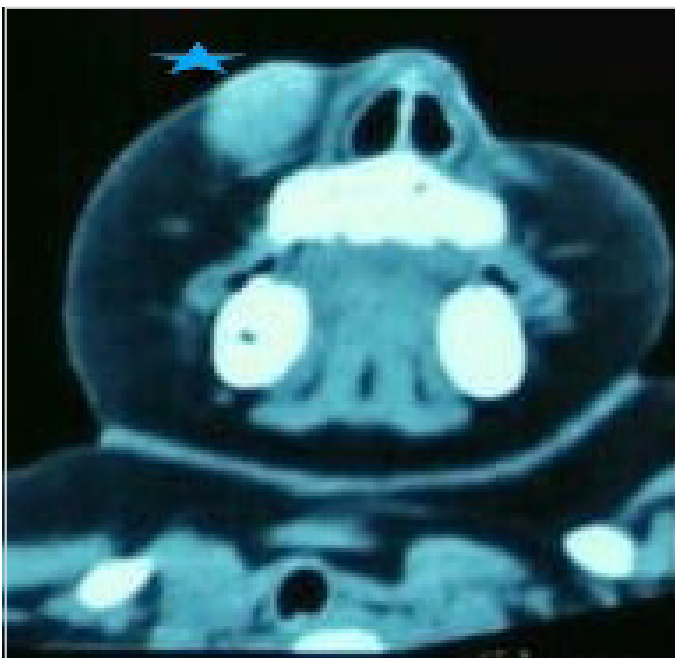
Figure 2. Contrast enhanced CT imaging showed an enhancing well-defined ovoid mass (5-point star) on the right side of the face with no bony erosion CT: Computed tomography