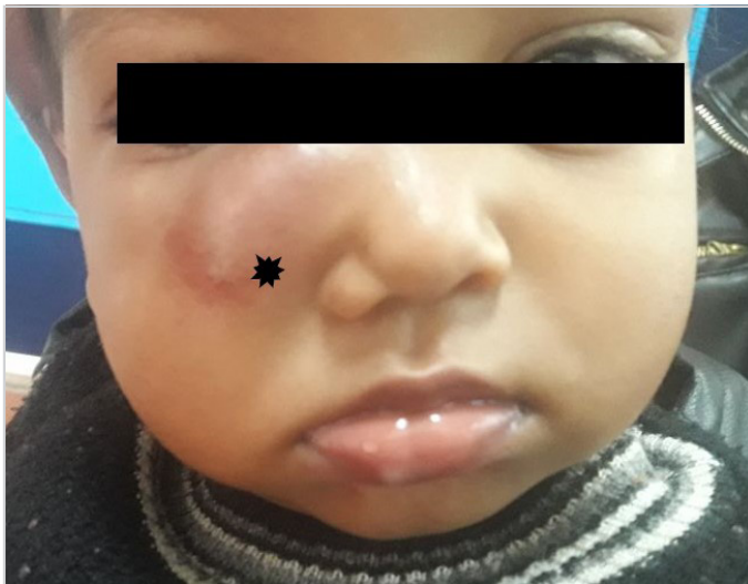
Figure 1. Right cheek swelling 3.0x2.5 cm (multi-point star)

Color Doppler USG revealed a well-defined vascular cystic lesion in the right cheek highly suggestive of a pseudoaneurysm. CT images were suggestive of a large vascular mass; however, the exact origin of the lesion could not be confirmed (Figure 2). The child was taken up for surgical excision under general anaesthesia. The mass was dissected in toto and was found to be arising from the distal branch of the facial artery (Figures 3, 4). A standard pressure dressing was applied for 48 hours. The postoperative period was uneventful, and the child recovered well. Histopathological examination confirmed the diagnosis of pseudoaneurysm.