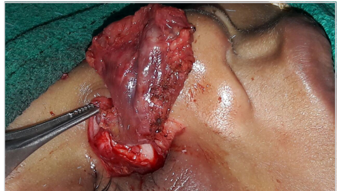
Figure 3. Vascular mass arising from distal branch of right facial artery was excised in toto

Incomplete tear of the involved vessel wall causes blood to flow into the surrounding tissue resulting in tamponade and clot formation (1). Hemorrhage persists until the pressure in the periarterial zone equals the mean arterial pressure (4). Ultimately, the hematoma organizes. The perivascular connective tissue forms an endothelial lined sac leading up to the pseudointima (4). Eventually, the hematoma liquefies. The result is a communication between the artery and the aneurysmal sac, forming a pulsating mass. The persistent arterial pressure results in gradual expansion of the false aneurysm. The final outcome is further growth or rupture of the pseudoaneurysm. Thus, the time between the trauma and the clinical presentation of the pseudoaneurysm varies from days to years (1).