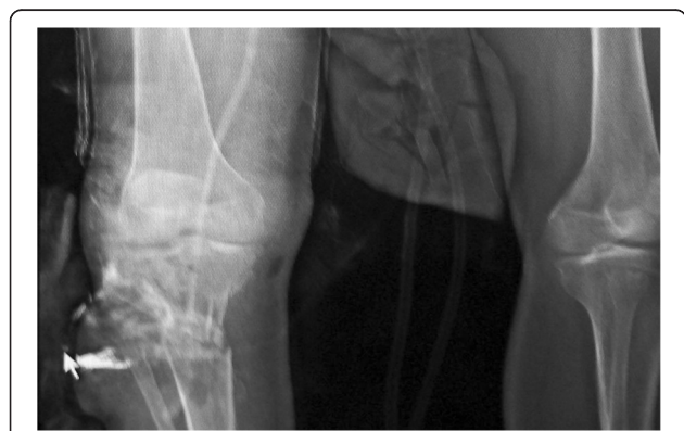
Figure 1 Transection of the right popliteal artery at the level of the trifurcation after gunshot injury (Lodox picture). Bullet fragment can be seen right to white arrow.

In cases of skeletal injury accompanied by significant bone instability or length shortening, distal revascularisation was initially achieved by the use of a temporary arterial shunt. In these cases, skeletal fixation followed immediately, as did removal of the temporary shunt and replacement of it by a vein or PTFE graft. Temporary shunting (Figure 2) also was used in cases of physiologically instability of the