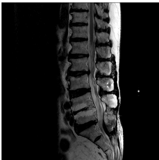
Fig. 2. Patient's saggital T2 image MRI.

diagnosed with bilateral trochlear nerve palsy. There were no abnormalities such as bleeding observed on the brain MRI, and according to the f/u for 6 months after discharge, the blurred vision improved.