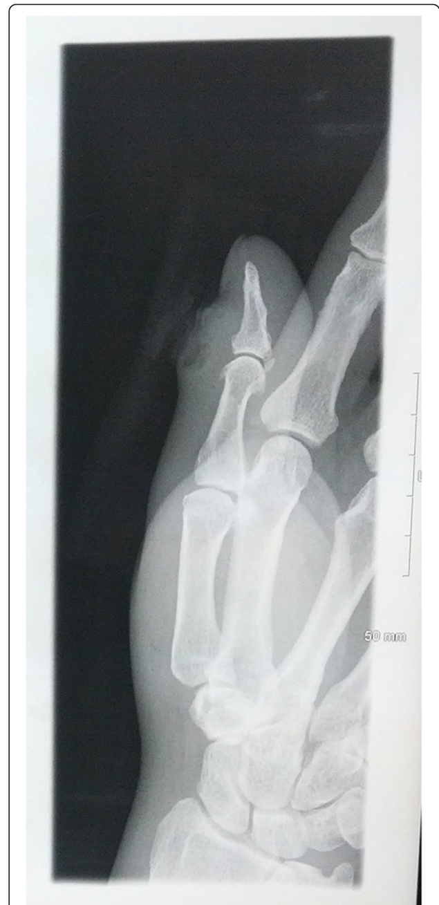
Figure 1 Right thumb radiographs taken on admission to the hospital. Plain films show cellulitis and edema of the skin overlying the interphalangeal joint of the first digit. There is no evidence of fracture, dislocation, or osteomyelitis.

The patient was initially treated with intravenous tobramycin, oral tetracycline, and intravenous ampicillin-sulbactam. Hydrogen peroxide immersion of his right thumb and wet to dry dressings were used for wound care. One day after admission, the patient's WBC decreased to 7.8K/uL, and Gram stain from the wound on initial presentation revealed moderate Gram-negative bacilli and a few Gram-positive cocci in pairs. Ampicillin-sulbactam