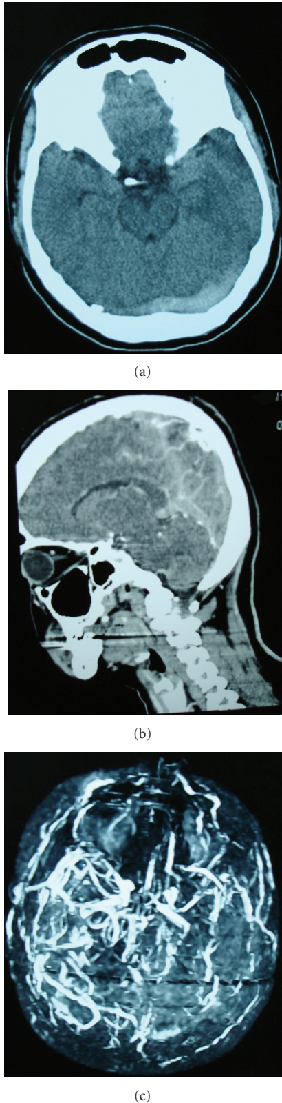
FIGURE 1: Cranial computerized tomography indicating left transverse sinus thrombosis. (b) Computerized tomography angiogram indicating superior sagittal and straight sinus thrombosis. (c) Magnetic resonance venography indicating the development of collateral circulation following the cerebral venous thrombosis.

Further blood samples were taken in order to investigate possible secondary aetiologies and at the same time subcutaneous low molecular weight heparin was initiated.