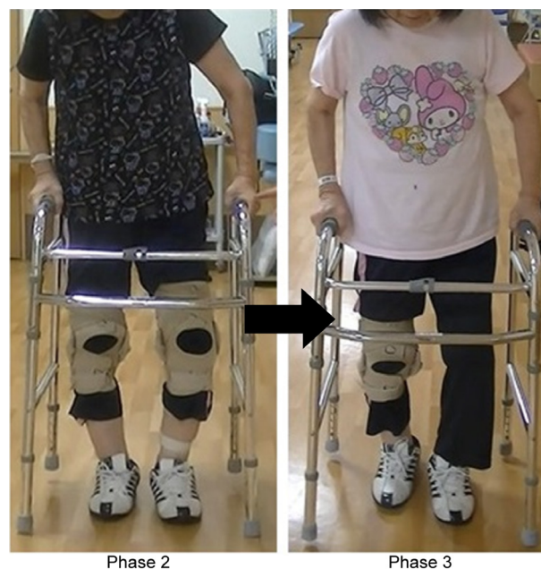
Fig. 3. Walking with a fixed-type walker in phases 2 and 3. The left upper limb was more supportive in phase 3 compared to phase 2; the lateral tilt of the left knee and bilateral knee pain were reduced. The patient could carry her body weight for a longer time.

170° without pain and could briefly maintain a standing position with support of only the left upper limb. She could move independently with a wheelchair, walk for about 5 m using a fixed-type walker if (wearing knee support on both knees), and finally could go to the toilet by herself.