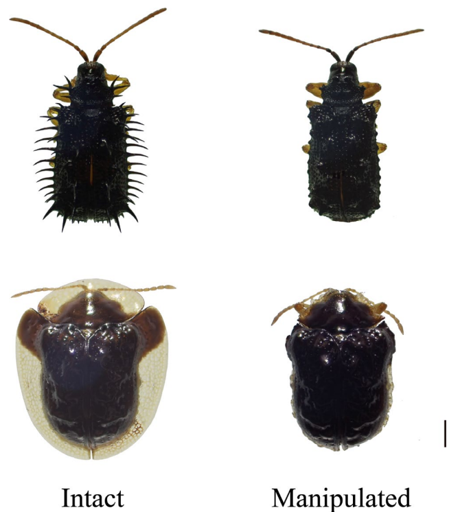
FIGURE 1 Dorsal aspects of spined prey ( Dactylispa issikii , upper) and armored prey ( Cassida sigillata , lower) used in predation experiments. Scale bar, 1 mm

In this study, we evaluated the defensive function of external morphologies in Cassidinae leaf beetles. To determine whether dorsal spines and explanate margins have different defensive functions against different types of predators, we manipulated the external morphologies of two prey species and presented them to three predator species. We focused on three generalist predator types: a stinger, a biter, and a swallower. If primary defense by crypsis or aposematism plays a role, prey with dorsal spines and explanate margins, indicators of inconspicuousness or unprofitability, are expected to be less frequently attacked by predators than those without these morphologies. This prediction depends on the ability of predators to perceive these indicators from a distance (e.g., visually). This assumption is generally met for the predators evaluated in this study. Primary defenses reduce per capita mortality more substantially than secondary defenses and therefore are under stronger natural selection (Ruxton, Allen, Sherratt, & Speed, 2018). However, adaptation by predators may overcome primary defenses (Ruxton et al., 2018). In this case, secondary defense mechanisms