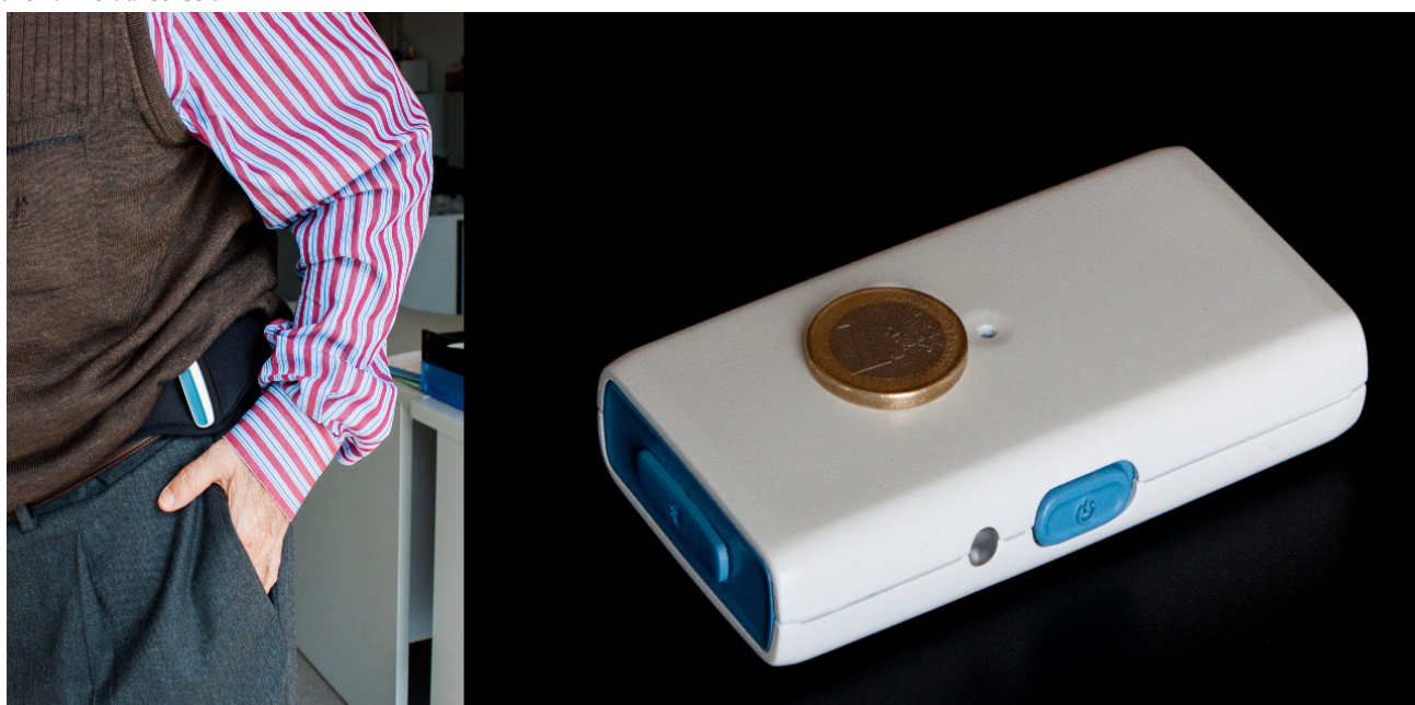
Figure 1. Inertial sensor.