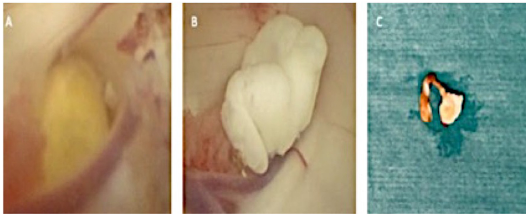
Fig. 2. (A) Endoscopic view of the right-sided foramen of Monro, pre-resection. (B) Endoscopic view of the right-sided foramen of Monro, during resection. (C) Macroscopic view of the parasite, after resection.