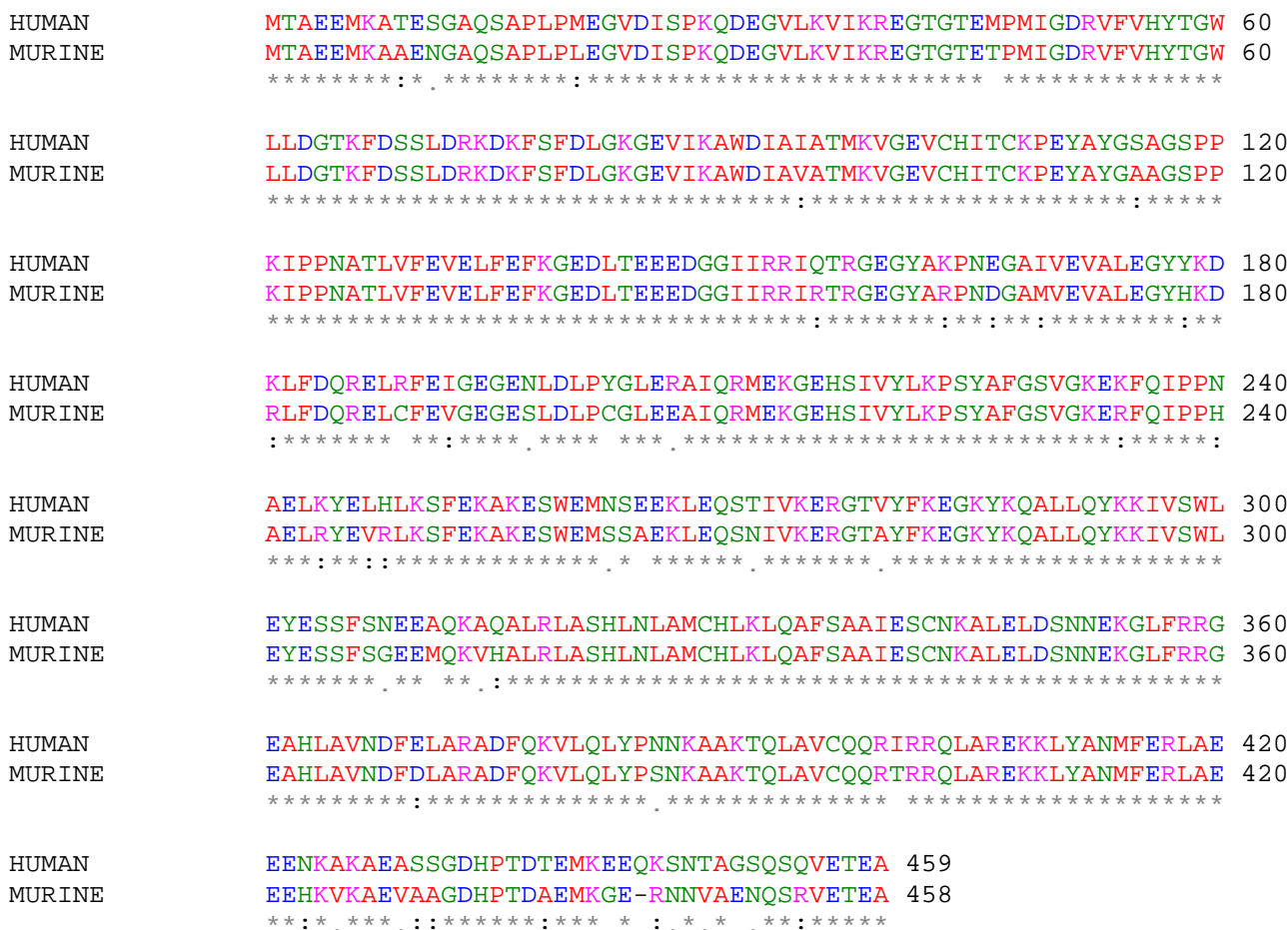
Figure 3 Homology between the FKBP52 protein in humans (ref|NP_002005.1|) and the fkbp52 in mice (ref|NP_034349.1|). Alignments were performed with ClustalW revealing 89% homology between the two sequences.

The present report indicates that alterations in the sequence and in the expression of the FKBP4 gene are not a common cause of non-syndromic hypospadias. Furthermore it alerts to the importance of performing extrapolation from an animal model to humans with caution, despite the undeniable usefulness of model organisms,