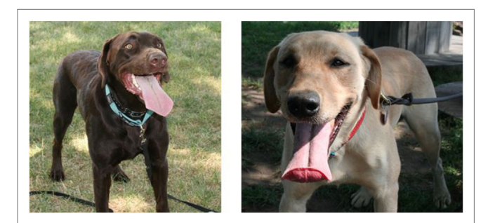
FIGURE 2 | Dogs during and after exercise demonstrating signs of exercise in the heart, include spade tongue, squinty eyes, ears retracted.

Similar to previous studies, the following data were collected (2–4, 6–8, 13, 19–28). Two samples of venous blood (~3 mL; jugular, cephalic, or saphenous) were collected on each exercise challenge day to evaluate pre- and immediate post-exercise analytes. Pre-exercise blood samples were collected between 7 and 9 a.m., whereas post-exercise blood samples were collected immediately (0-min) post-exercise before the cooldown period. Blood samples were taken anaerobically from a peripheral vein and analyzed immediately. Venous blood pH, gases (PvCO<sub>2</sub>, HCO<sub>3</sub>, TCO<sub>2</sub>, PvO<sub>2</sub>, SvO<sub>2</sub>), electrolytes (iCa, Na, K), base excess in extracellular fluid compartment (BEecf), glucose, hemoglobin,