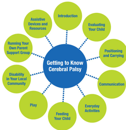
FIGURE 1 Outline of modules for parent support group training, available at http://disabilitycentre.lshtm.ac.uk/getting-to-know-cerebral-palsy/ [Colour figure can be viewed at wileyonlinelibrary.com ]

screening was used to find sufficient local cases to run the group. Children had a confirmed diagnosis of cerebral palsy and were aged 18 months to 12 years, and caregivers had not attended any parent support group nor any regular physiotherapy with their child.