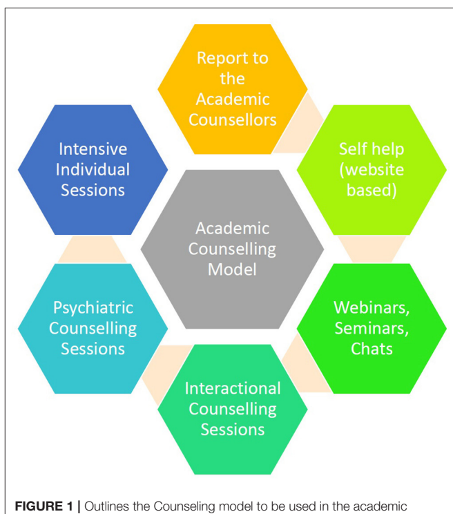
institutions if an individual gets afflicted with COVID-19.

The study foremost strength is to identify the existence of psychological and mental health issue post COVID-19 episode among the survivors at the university. The severity of the IES-R score may depend on the complete loss of taste and sense of smell. The study also emphasizes the need for the development of an academic counseling model to be used at the college and university level to address the issue as it may affect the academic