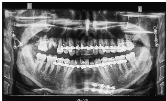
Figure 2: Postoperative orthopantomogram image showing fixation of the bilateral condyle fractures with delta plate on the right side and straight plate on the left side, with three-dimensional plate at left parasymphysis fracture

The patient underwent ORIF under GA, arch bar splinting of the maxilla and mandible was done, and IMF placed with teeth in occlusion, through the existing wound over the chin, mandibular symphysis fracture was exposed, reduced and fixation done with 2-mm 4-holed titanium plate. Right-side subcondylar fracture was exposed through the retromandibular approach, and reduction and fixation of the fracture was done with trapezoidal plate. Left-side condylar neck fracture was similarly exposed, and reduction of the fracture was done with the help of traction of distal segment. Fixation was done with trapezoidal plate [Figures 3 and 4]. Postoperatively, mouth opening was 40 mm, and lateral excursions were good.