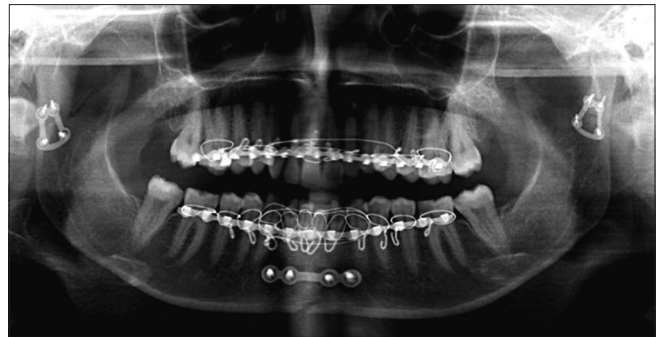
Figure 4: Postoperative orthopantomogram showing fixation of the bilateral condyle fractures with trapezoidal plate on both sides