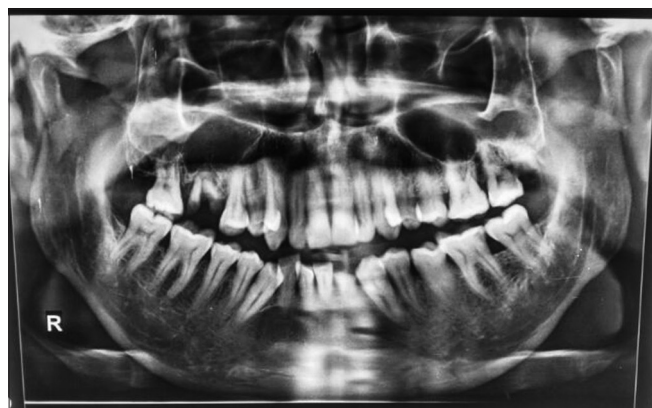
Figure 1: Preoperative orthopantomogram showing bilateral low condylar fractures and left parasymphysis fracture

Postoperatively, on day 1, occlusion and jaw movements were checked along with any deficits of facial nerve branches. No