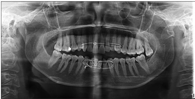
Figure 3: Preoperative orthopantomogram revealing right low condylar fracture and left condylar neck fracture and symphysis fracture of the mandible