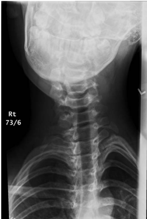
Fig. 1. X-ray showing the subject’s head position. With no neurological signs or peripheral nerve complaints, the patient retained full flexion and right-sided cervical rotation. Neck extension was limited to 20 degrees, and left cervical rotation did not go beyond midline.