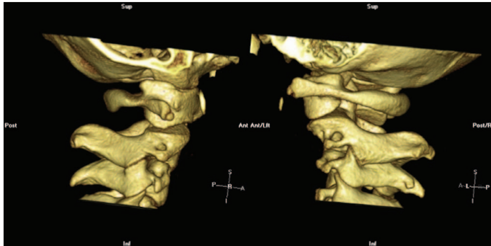
Fig. 3. 3D CT images of C1–C3 after correction with halter traction and splinting. Right and left view. Note asymmetry of C2 lateral masses.

preexisting cervical skeletal anomalies and/or aggressive rotational positioning must be considered potential causes. In our case, we did not note any difficulty achieving intraoperative positioning or operate in extreme rotation.