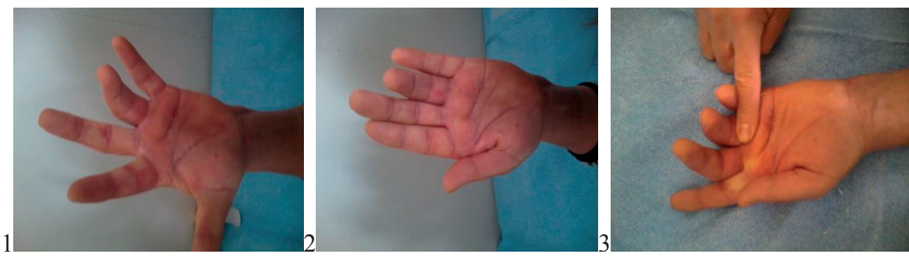
Figure 3. Week 6: 1. abduction, 2. adduction, 3. flexion and extension of interphalangeal joint.

Many authors in their studies after rehabilitation program evaluated grip strength. Riaz. et al. (21) in their study reported the results of grip strength, where 94% of cases were good after rehabilitation. A study done by