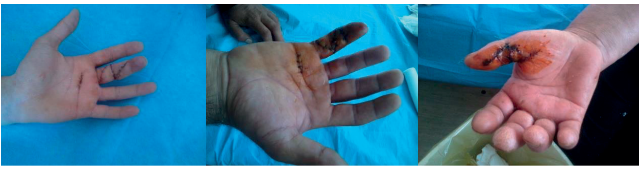
Figure 1. Flexor tendons repair in zone II.